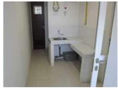
Pantry attached to bedroom